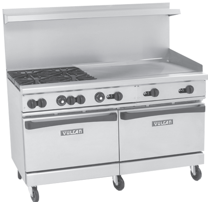
Model G60SS-4FT36 shown with optional casters